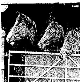
The stud farm must be commercial to qualify